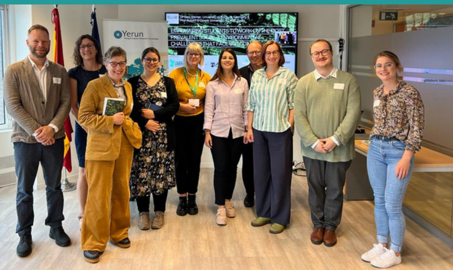
Speakers and moderator of the EULab and YERUN even: "Blended Mobility, Innovative pedagogies and the Green Transition"

The YERUN ad hoc group on SDGs has been focused the design and preparations of a YERUN Winter School on Sustainability for PhDs, which will kick off in 2025 supported by a BIP (Blended Intensive Programme, EU funded). Furthermore, the group has also started a peer learning process on sustainability relating to strategies and governance, which will be the object of next year's work as well. On the topic of sustainability, in September YERUN has co-organised an event linked to the EULAB project, an Erasmus+ project led by the University of Limerick that brings together blended mobility, innovative pedagogies and the green transition. In the June newsletter , we highlighted our members' outstanding work on sustainability. Finally, in October the YERUN Office has participated in the final panel of a BIP led by the University of South-Eastern Norway on Driving Sustainable Futures, dedicated to university staff.