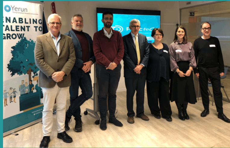
Speakers of the ProcToGo and YERUN even: "Exploring the potential of Micro-credentials"