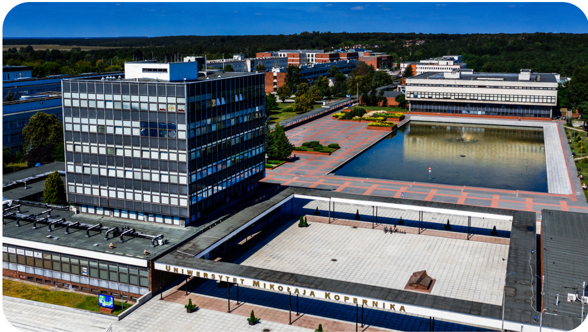
© NCU - Nicolaus Copernicus University in Toruń