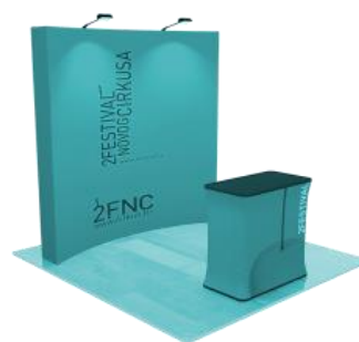
Standard Package (image not contractual)